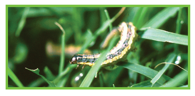
Armyworm caterpillar.